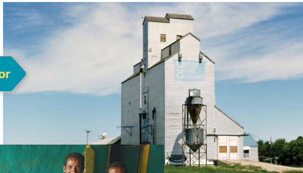
Canadian Grain Elevator

In Canada, farmers are able to store food in grain barns that regulate conditions and allow crops to be sold year round. In Africa, infrastructure is much weaker, weather conditions are far more erratic, and there are pests that will eat all crops that are not stored well.