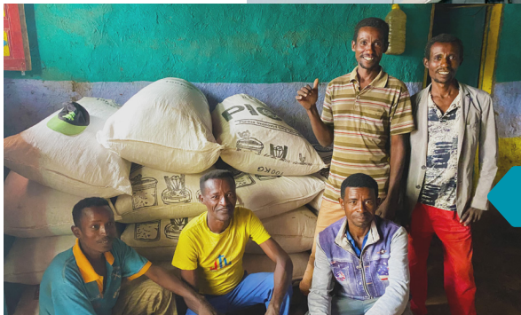
PICS bag in Africa