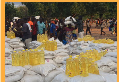
Food distributions to Cylone Idai funded by your generous donations.

LifeStyle Changes: Consider how your personal actions might affect the poor. Does the way you live reflect God's justice, His care for the poor, and steward His creation?