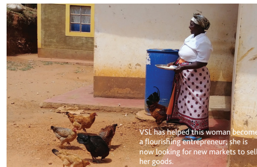
VSL has helped this woman become a flourishing entrepreneur; she is now looking for new markets to sell her goods.