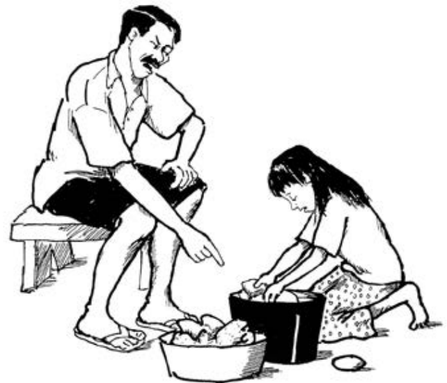
Look at this image. Who is the figure of authority in this image? Reflect on the fragile nature of relationships and how the misuse of power can turn to violence and abuse.