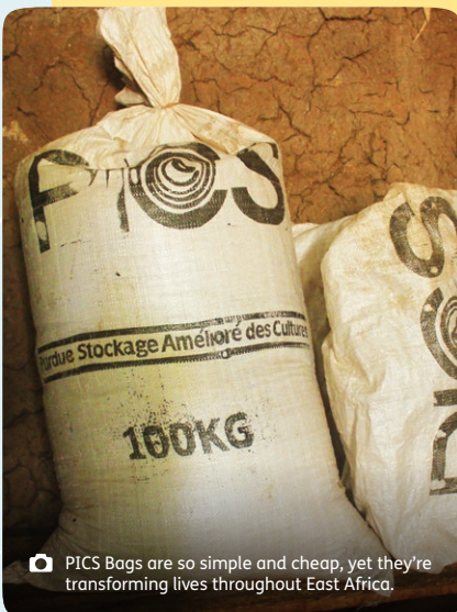
PICS Bags are so simple and cheap, yet they're transforming lives throughout East Africa.