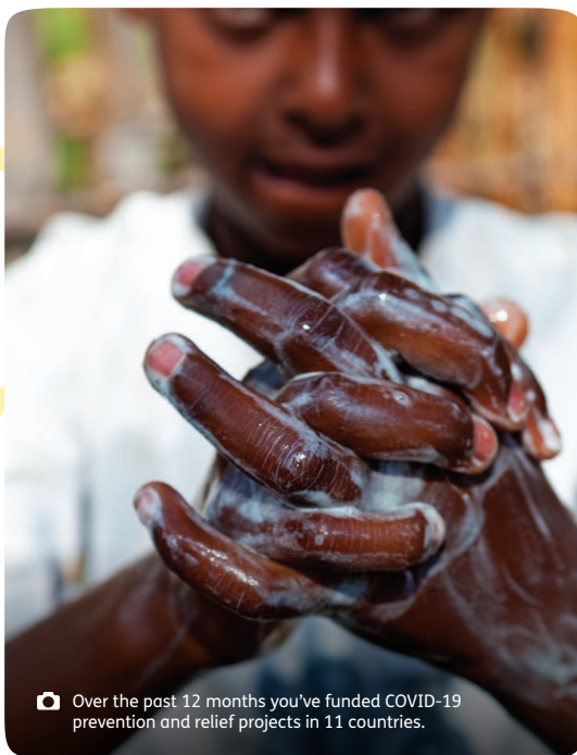
Over the past 12 months you've funded COVID-19 prevention and relief projects in 11 countries.

I invite you to continue to support the Tearfund movement to end extreme poverty. In the light of the challenges of the global pandemic, join us as we pray for wisdom. We already see indications of deepening poverty. It will take courage to respond.