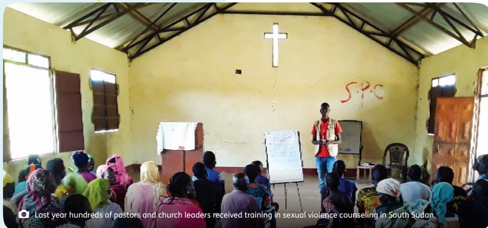
📷 Last year hundreds of pastors and church leaders received training in sexual violence counseling in South Sudan.