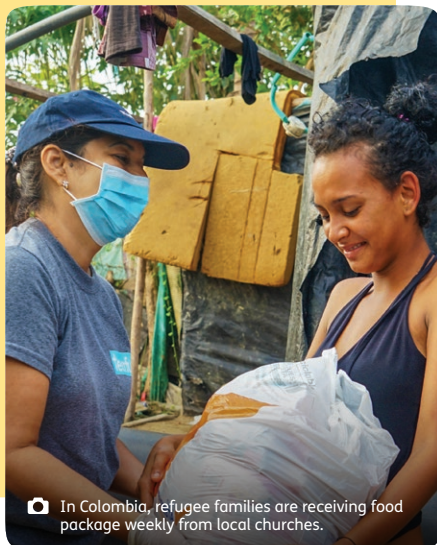
In Colombia, refugee families are receiving food package weekly from local churches.

Trusting God for the funds, you have helped us invest $1.8 million in COVID-relief programs. We are now helping families bridge the gap in all countries we work in, with a special emphasis on South Sudan, the DRC, Ethiopia, and Colombia. In the name of Jesus, we will go forward in prayer, courage and compassion, coming alongside our brothers and sisters living in extreme poverty.