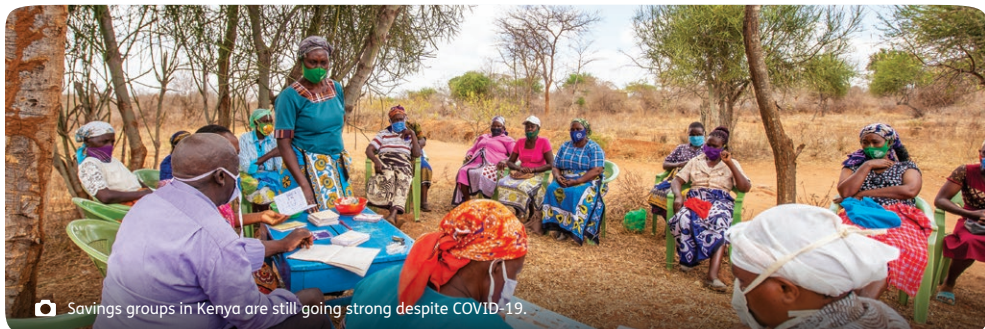
📷 Savings groups in Kenya are still going strong despite COVID-19.

Villagers were trained in marketing concepts – 4,959 OVER our GOAL.