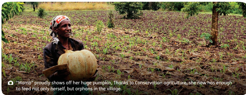
📷 “Mama” proudly shows off her huge pumpkin. Thanks to Conservation agriculture, she now has enough to feed not only herself, but orphans in the village.