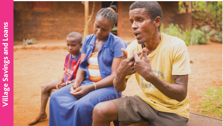
Village Savings and Loans

"This project has changed our lives completely"